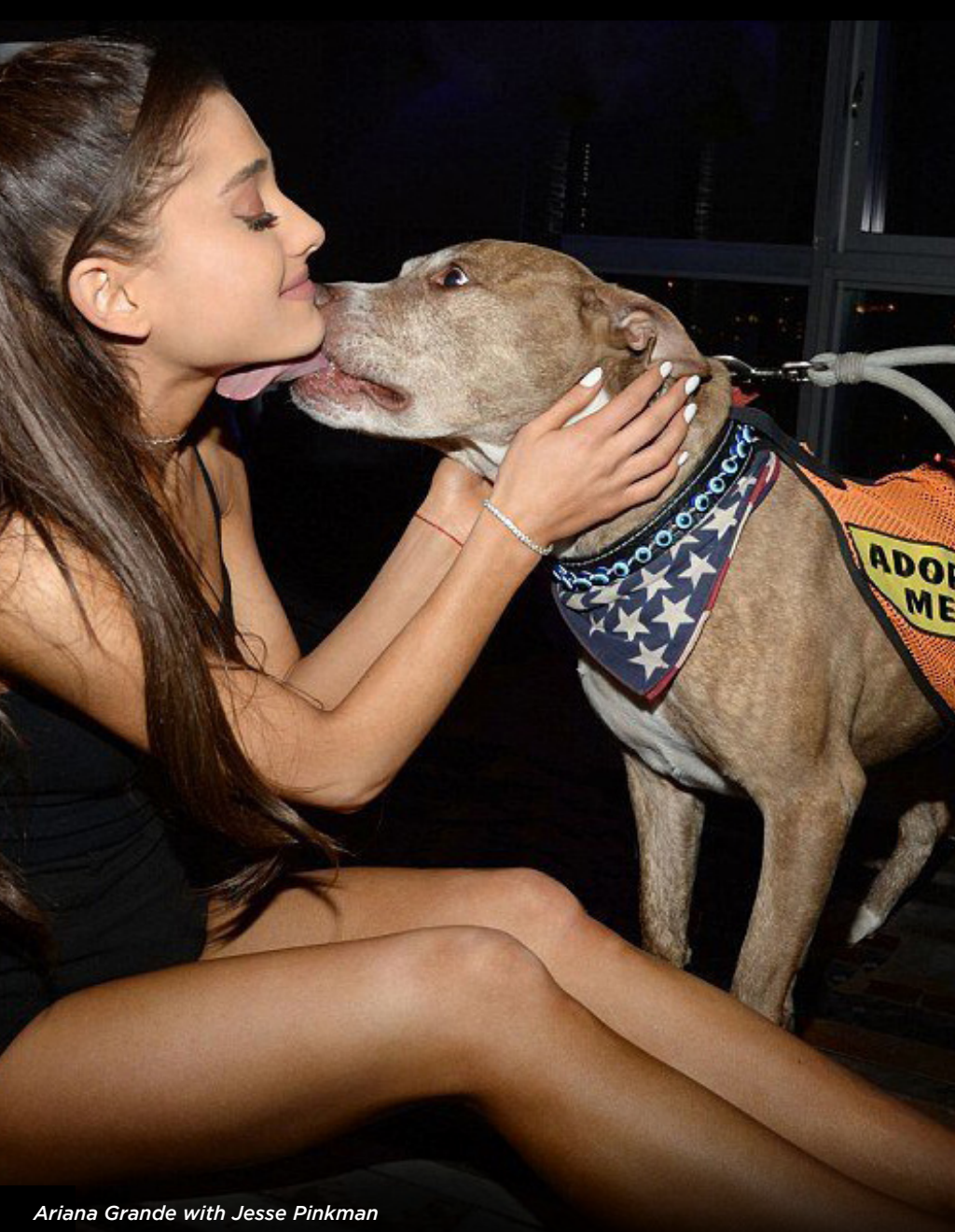
Ariana Grande with Jesse Pinkman