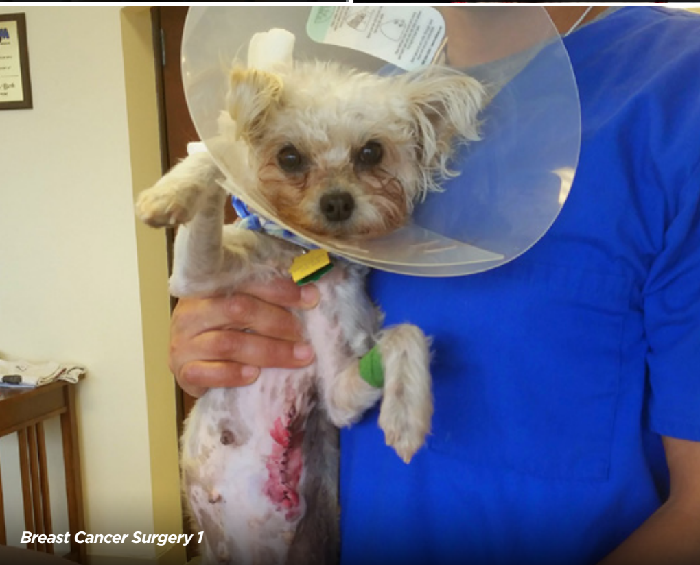
Breast Cancer Surgery 1